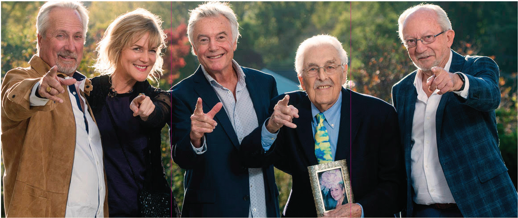
2019 Milley Recipients.